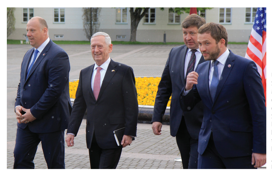
U.S. Defense Secretary James Mattis and the defense ministers of the Baltic States, where NATO is deploying battle groups for the first time, held talks.

respond with a positive step after the withdrawal by the United States. Despite the lack of intricate verification mechanisms, these informal reciprocal steps are sometimes more effective than formal bilateral arms control agreements with extensive verification schemes. The largest nuclear reductions ever achieved were realized thanks to the unilateral and reciprocal Presidential Nuclear Initiatives enacted between 1990-1991, when President Gorbachev and President Bush Sr. withdrew and eliminated thousands of tactical nuclear weapons. This example can now be repeated, if on a smaller scale. NATO and the U.S. clearly recognize the possibility of informal reciprocity, as indicated in NATO's Strategic Concept of 201018 and the 2010 U.S. Nuclear Posture Review.19