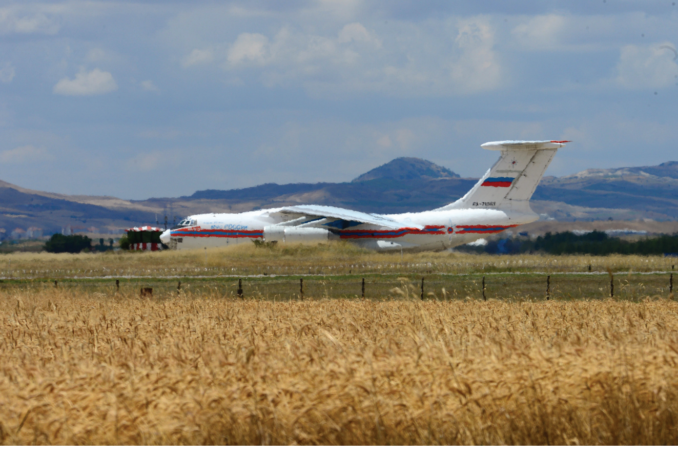
A Russian AN-124 cargo aircraft carrying components of the S-400 air defense system, lands at Murted Airfield in Ankara on July 12, 2019.